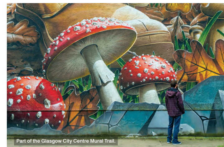
Part of the Glasgow City Centre Mural Trail.