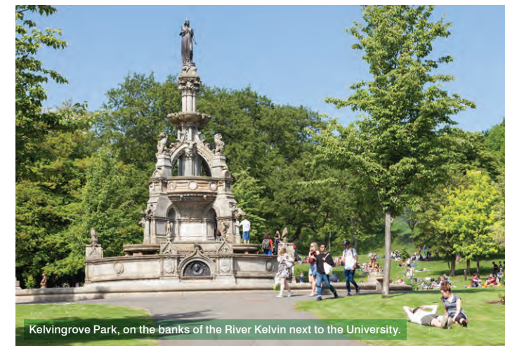
Kelvingrove Park, on the banks of the River Kelvin next to the University.