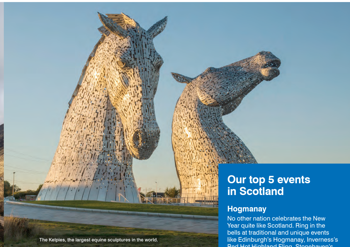
The Kelpies, the largest equine sculptures in the world.

To find out more, see visitscotland.com .