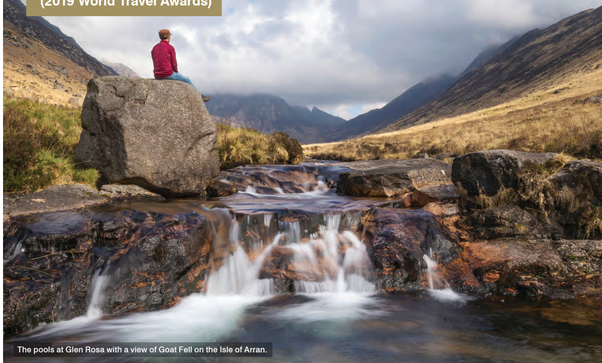
The pools at Glen Rosa with a view of Goat Fell on the Isle of Arran.