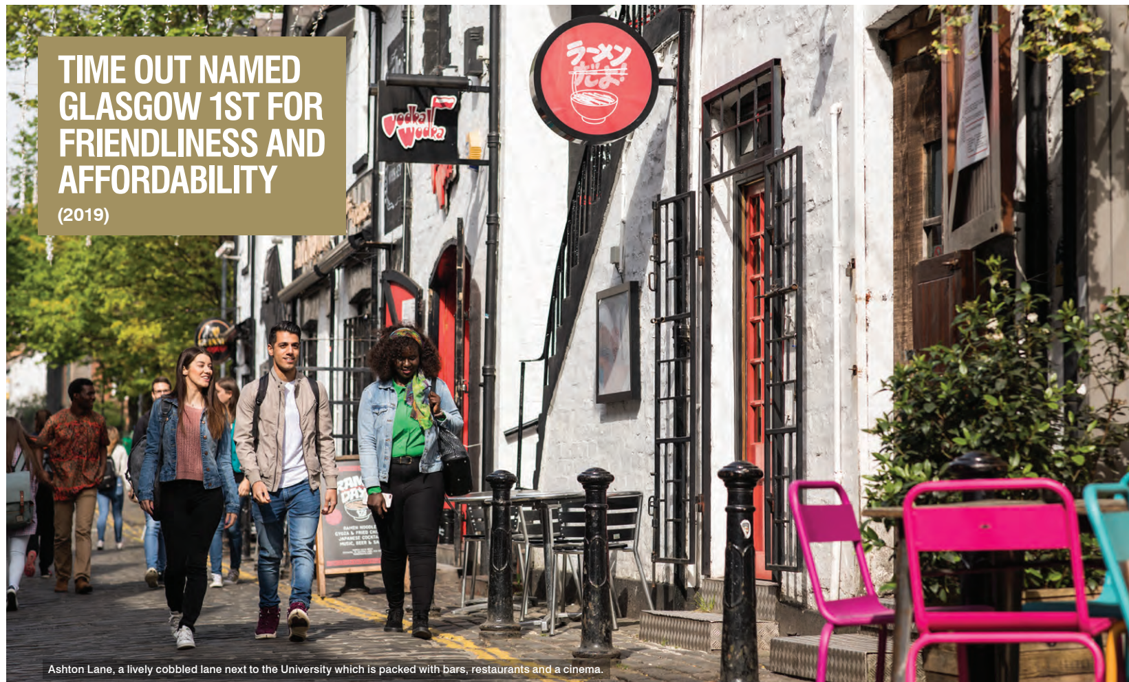
Ashton Lane, a lively cobbled lane next to the University which is packed with bars, restaurants and a cinema.