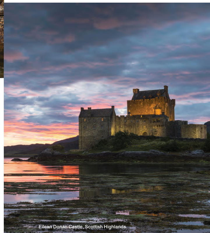
Eilean Donan Castle, Scottish Highlands.

Experience Scottish culture and traditions at over 70 events across the country, taking place between May and September.