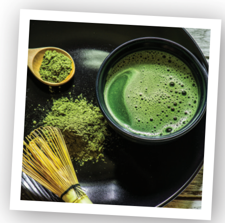
Sado (Tea Ceremony)