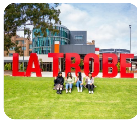
La Trobe University, Bendigo Campus