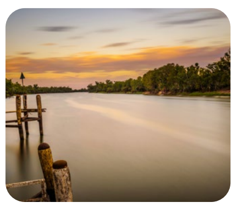
The Murray River near Mildura