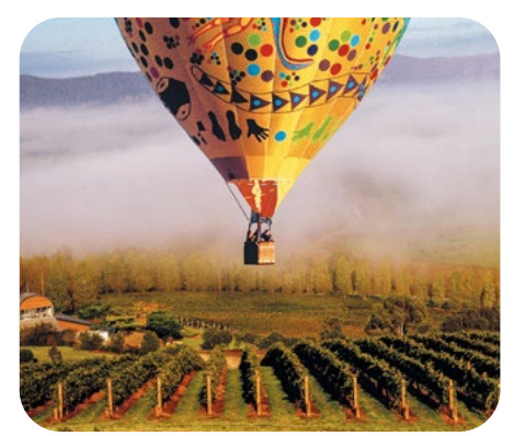
An early morning balloon ride