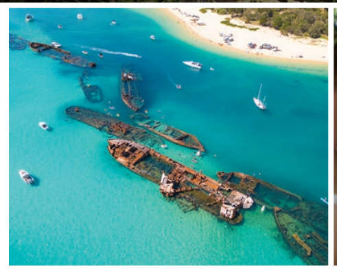
Escape to Mulgumpin (Moreton Island) or Minjerribah (North Stradbroke Island) for the weekend with your mates