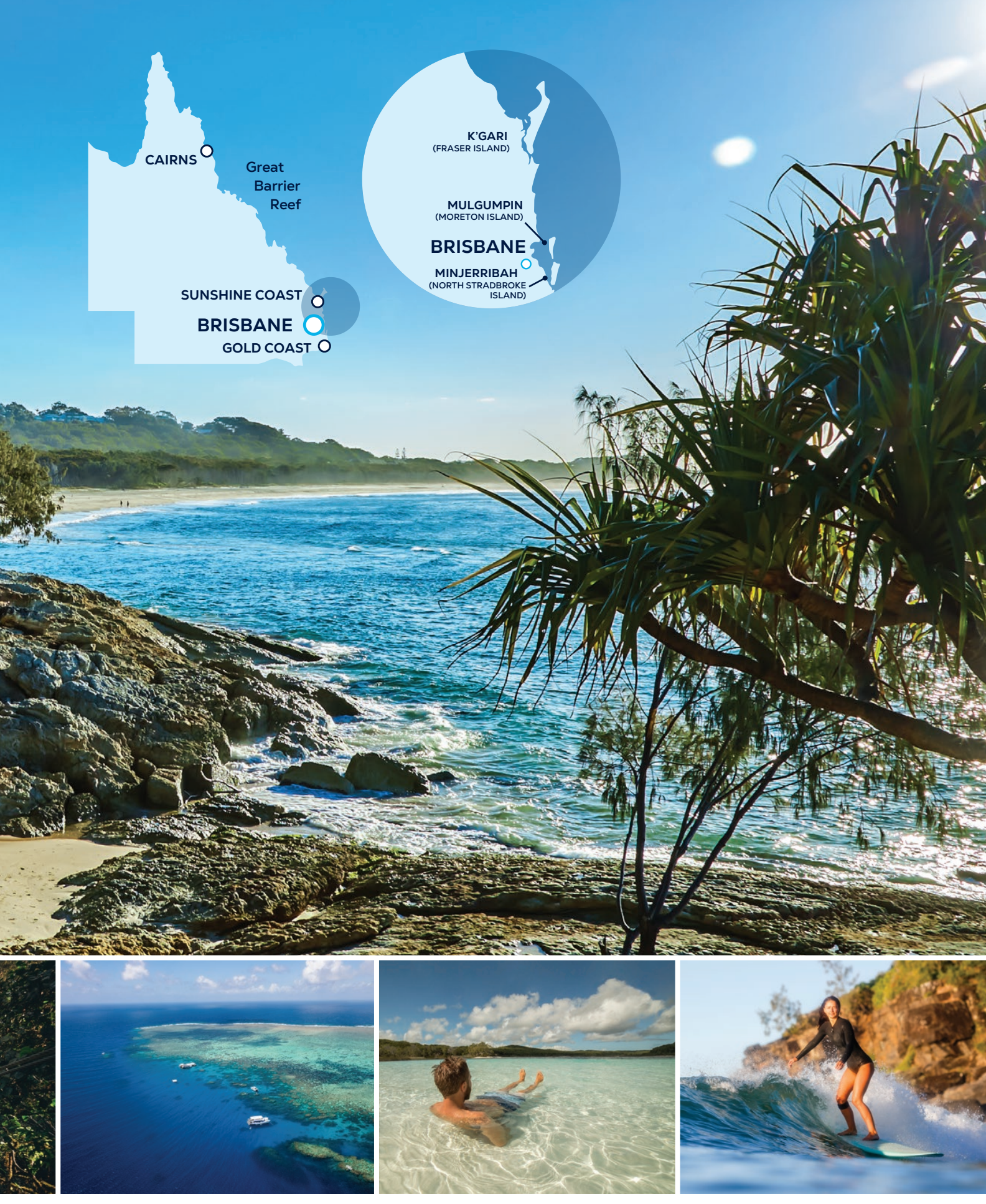
Snorkel on the Great Barrier Reef, a world heritage-listed natural wonder