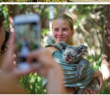
Cuddle a koala at Lone Pine Koala Sanctuary or Australia Zoo