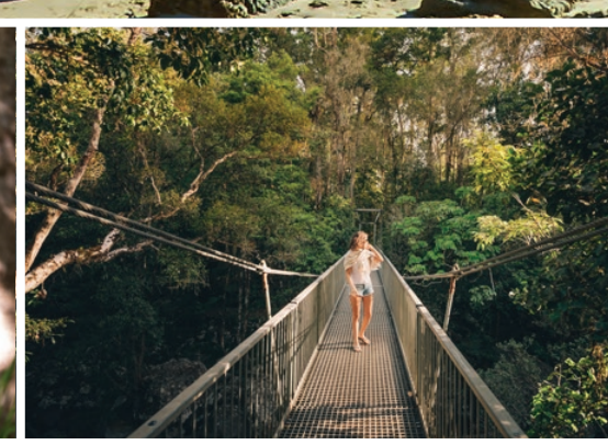
Explore Daintree National Park, the world's oldest tropical rainforest